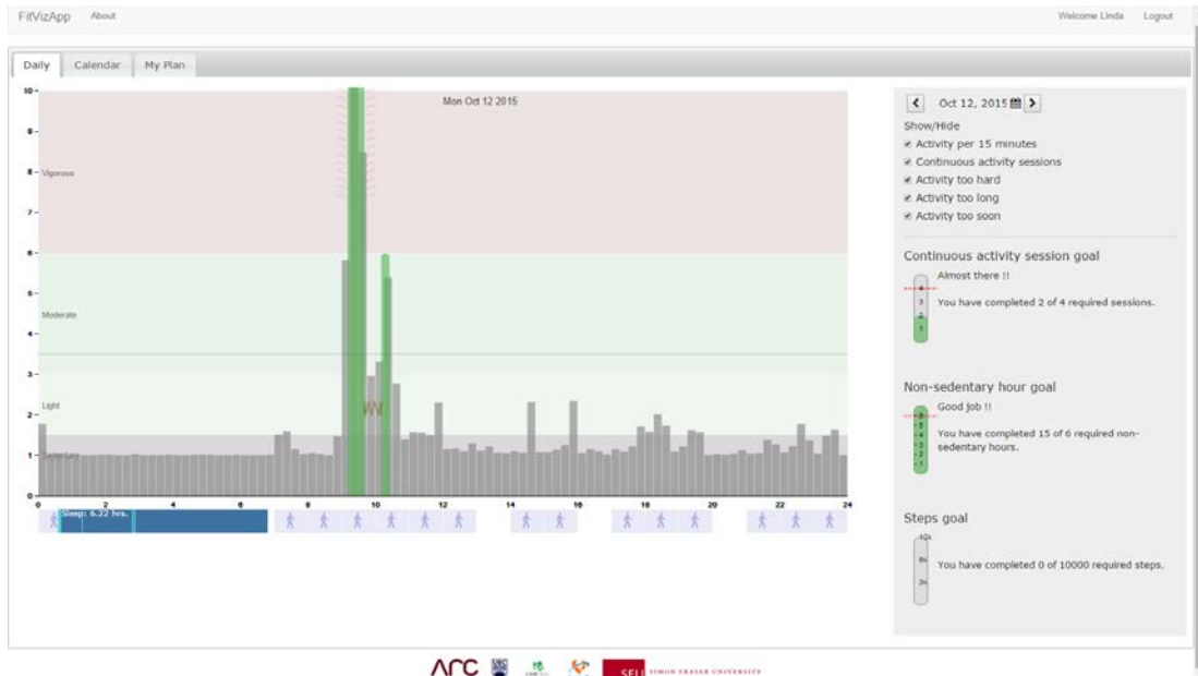
Figure 2: FitViz (Shaw, Li) showing exercise bout over a 24-hour period

healthcare providers to personalize targets of physical activity intensity, duration and frequency, track activities levels, and receive feedback on the progress.